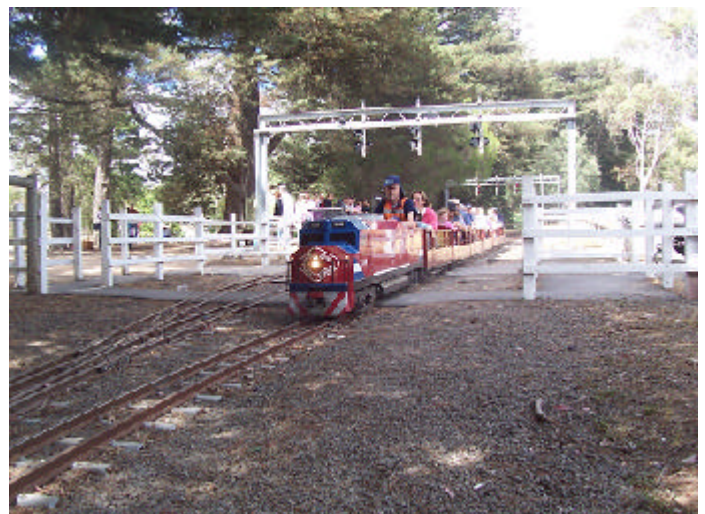
D2 1300 crossing Pine Creek's level Crossing.