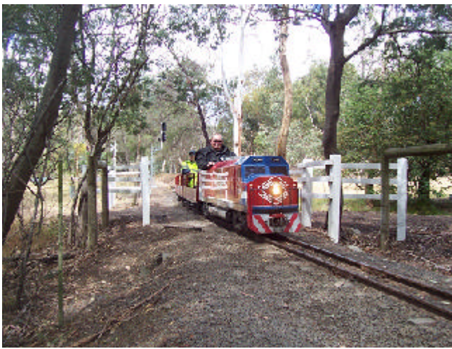
D2 1300 Crossing the Level crossing in reverse near Fork Tree Cutting.