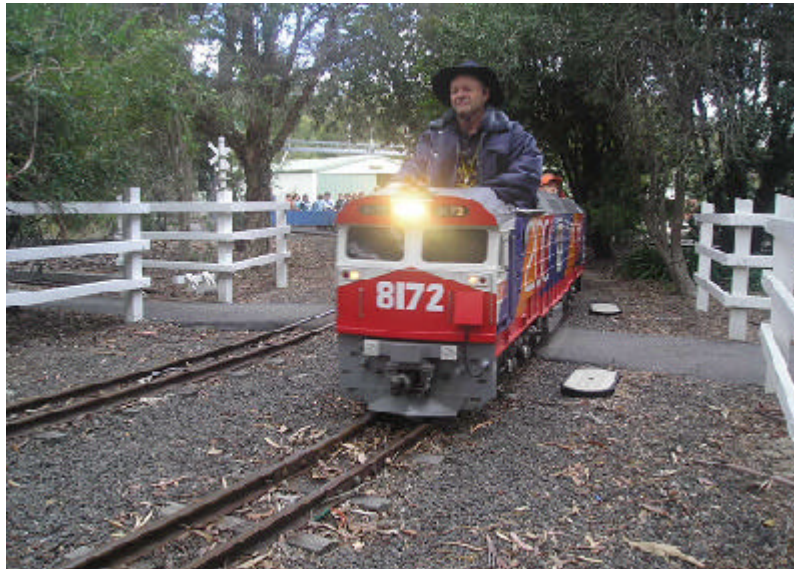
8172 passing the clubrooms