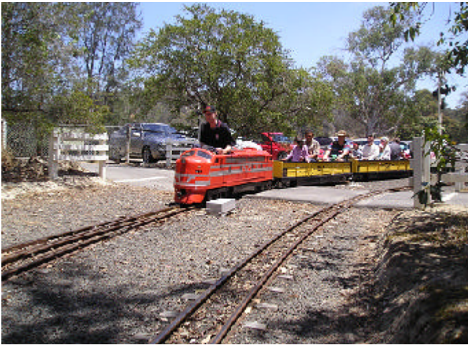
B71 passes the Road to Meadmore Junction.