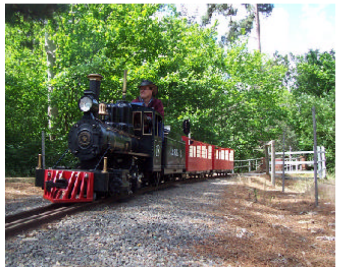
SR & RL no18 Crossing the same crossing as last shot.