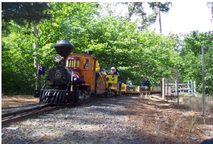
Pauline and Joyce Double had in the reverse Direction over the Level crossing at triple arch bridge