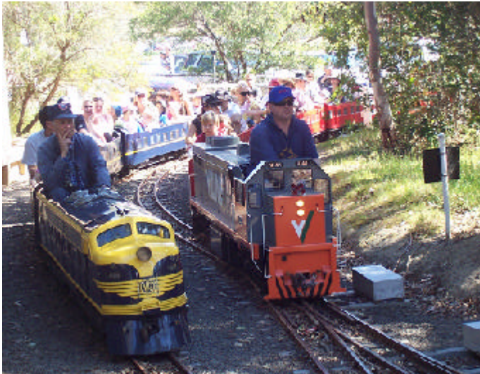
S301 and X44 take their trains over Meadmore Junction's Crossing.