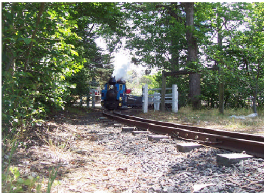
Tom Thumb passes over the access crossing near Pine Creek running in the reverse direction.