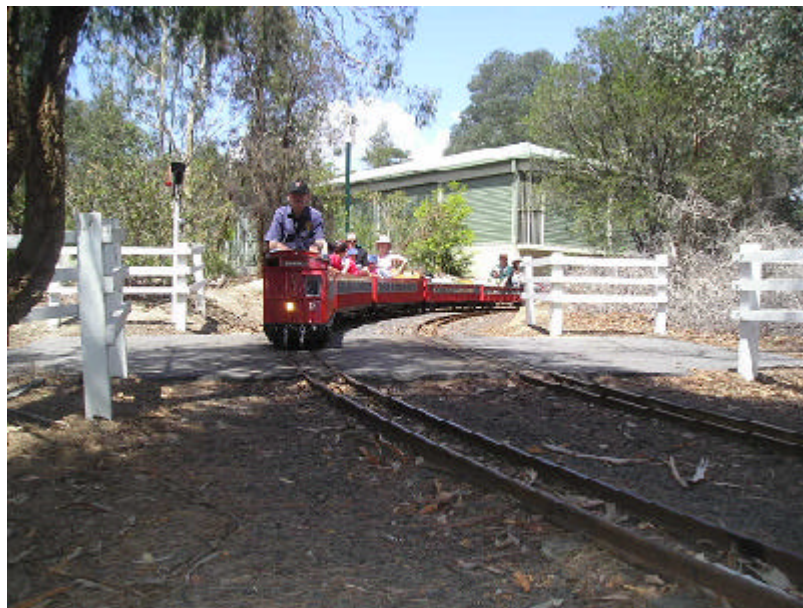
The Doggies and Tait set cross the final level Crossing before Diamond Valley Station.