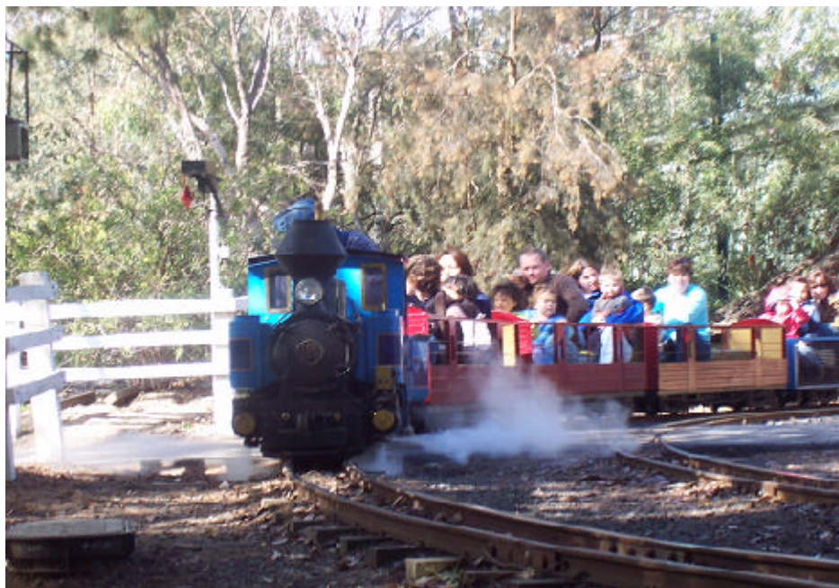
Tom Thumb passes the Wig Wag signal on its approach to Diamond Valley Station