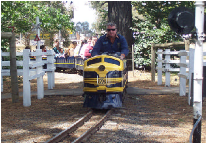
S301 passes the same crossing as the last shot.