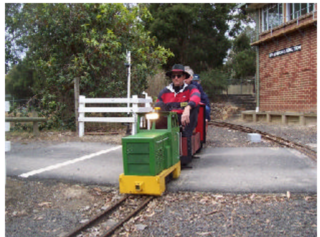
A visiting loco crosses the Meadmore junction crossing in reverse at the 45th birthday.