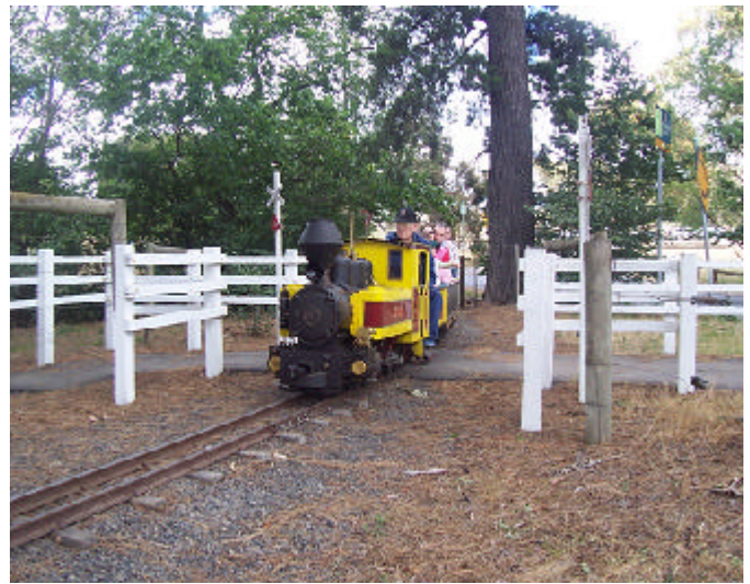
Joyce passes the crossing just before Pine Creek.