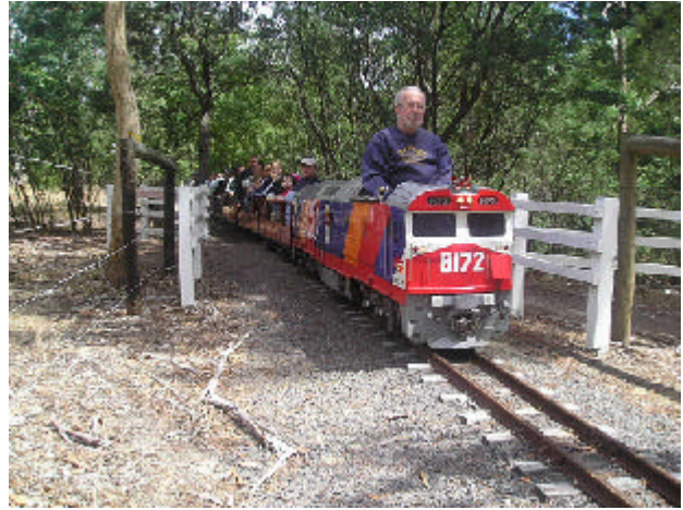
8172 Crossing the Level Crossing on the way towards Fork Tree Cutting.