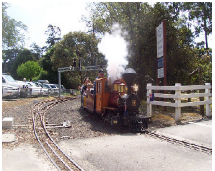
Pauline at Meadmore Junction level Crossing.