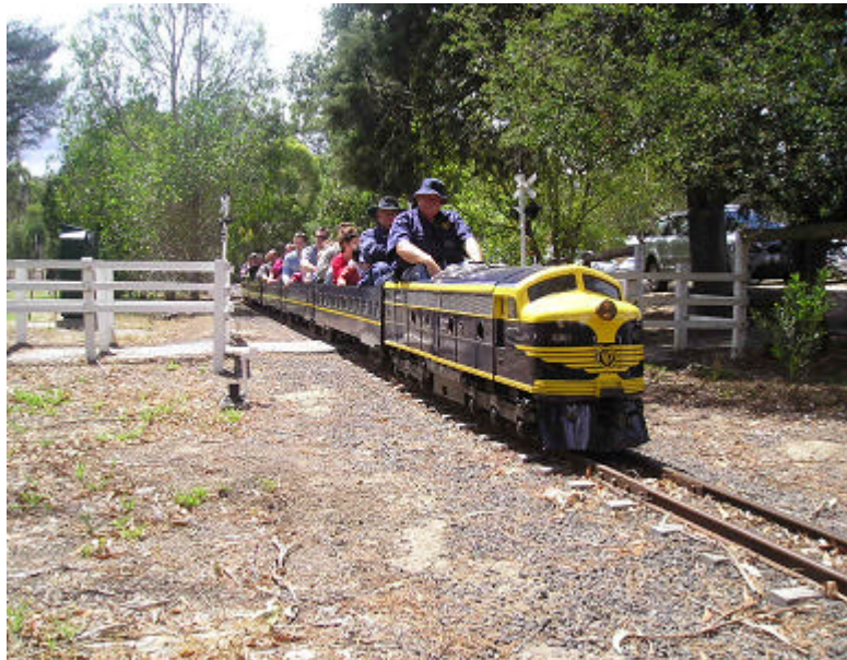
S301 passes over the pedestrian crossing on the way to Pine Creek